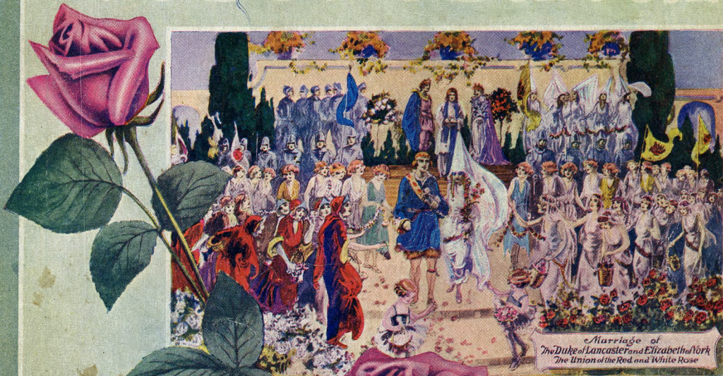
Marriage of The Duke of Lancaster and Elizabeth of York The Union of the Red and White Rose