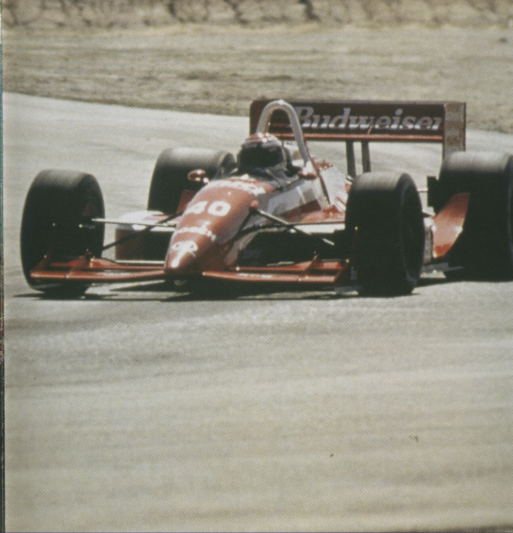
King Sports, Inc.