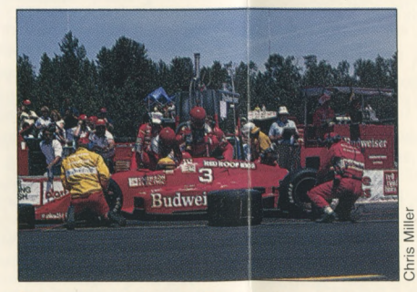
Pit crew works on Budweiser Indy car.

Grand Floral Parade Float Display Presented by Mervyn's Saturday, June 6-Sunday, June 7 Carousel Courtyard on N.E. Holladay between 7th and 9th Streets