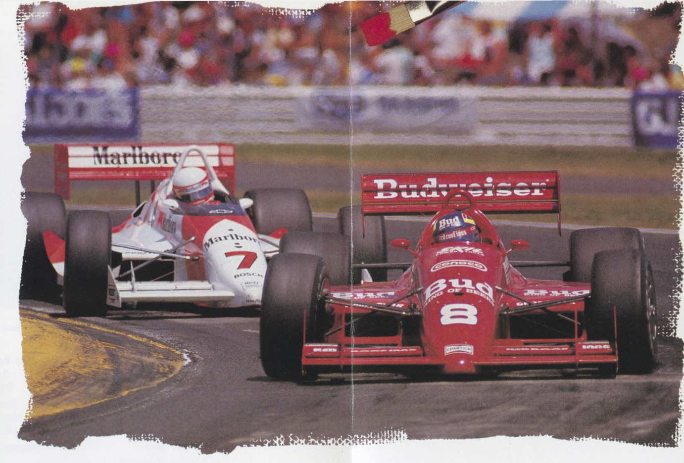
Racing action at Budweiser/G.I. Joe's 200

A CELEBRATION OF COLOR. The Portland Rose Festival bursts into life to brighten Portland and the entire state of Oregon during 24 days every June.