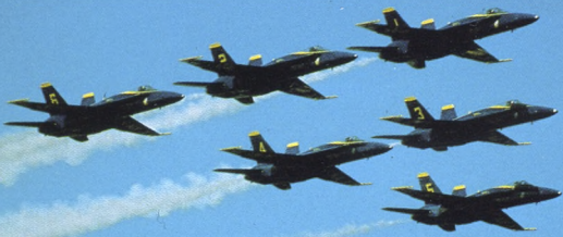
Maxwell House Rose Festival Airshow