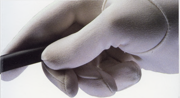
Dick Powers/Photo Art