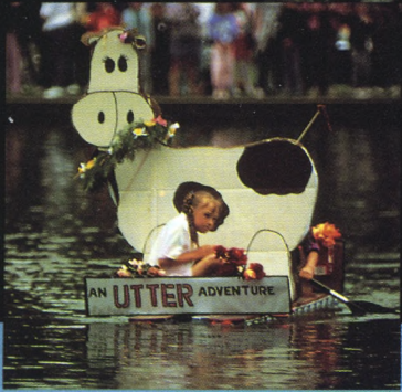
Skipper's/KPDX Milk Carton Boat Races