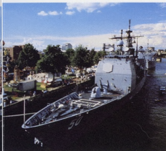
Coors Light/Pepsi Festival Center