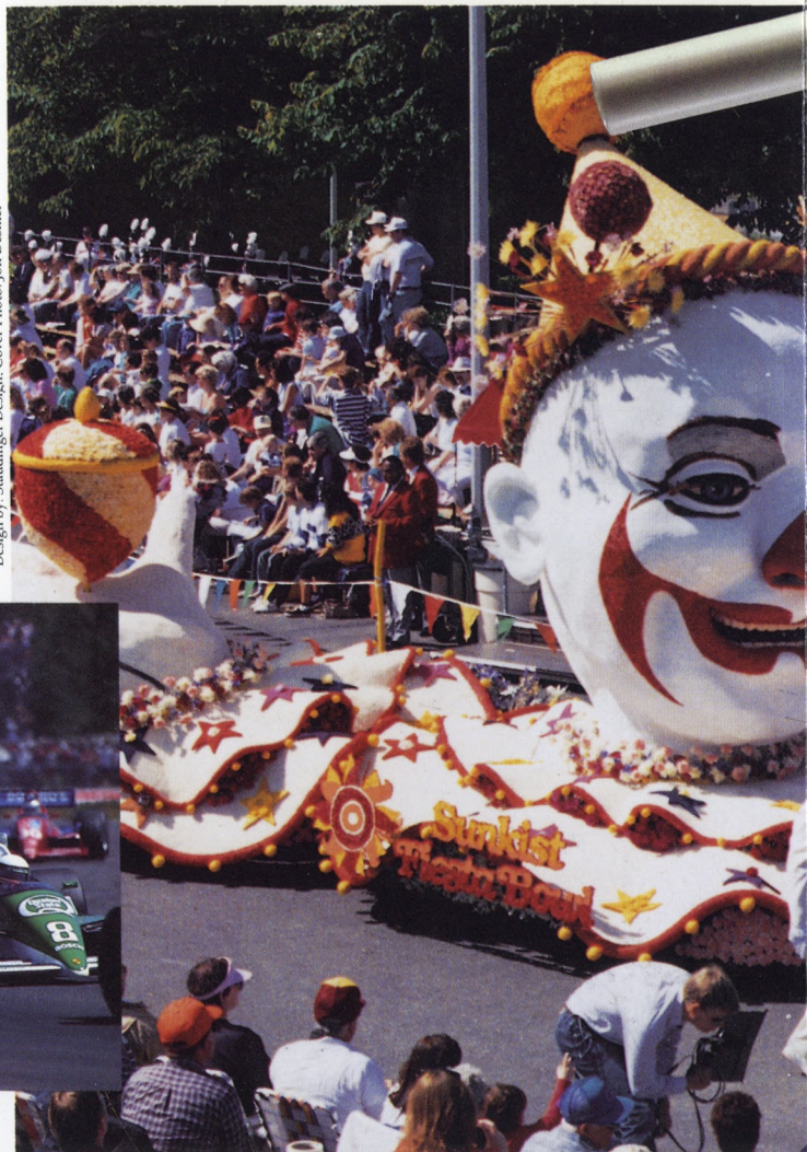
Design by: Staudinger Design.