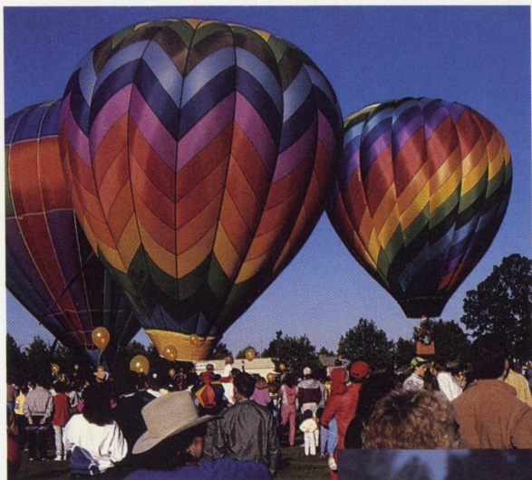
Dick Powers/Photo Art

The festival boasts two weekends of high-speed auto