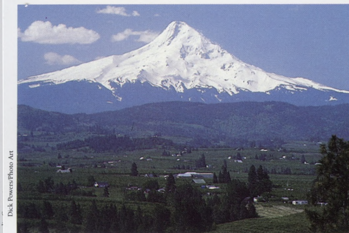
Dick Powers/Photo Art