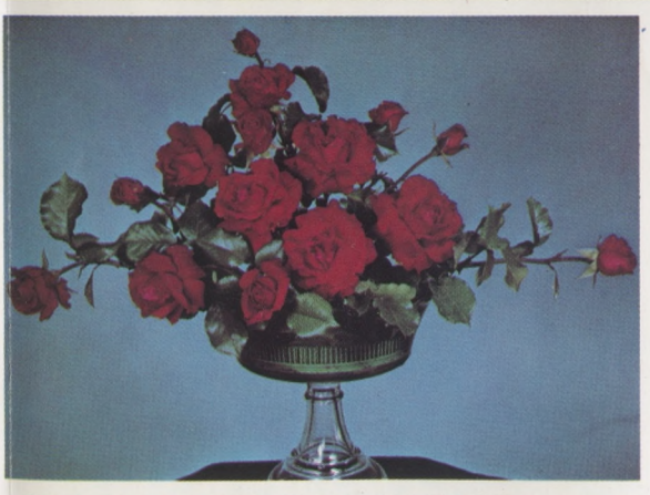
PORTLAND ROSE FESTIVAL ASSOCIATION 10 SOUTHWEST ASH STREET PORTLAND, OREGON 97204