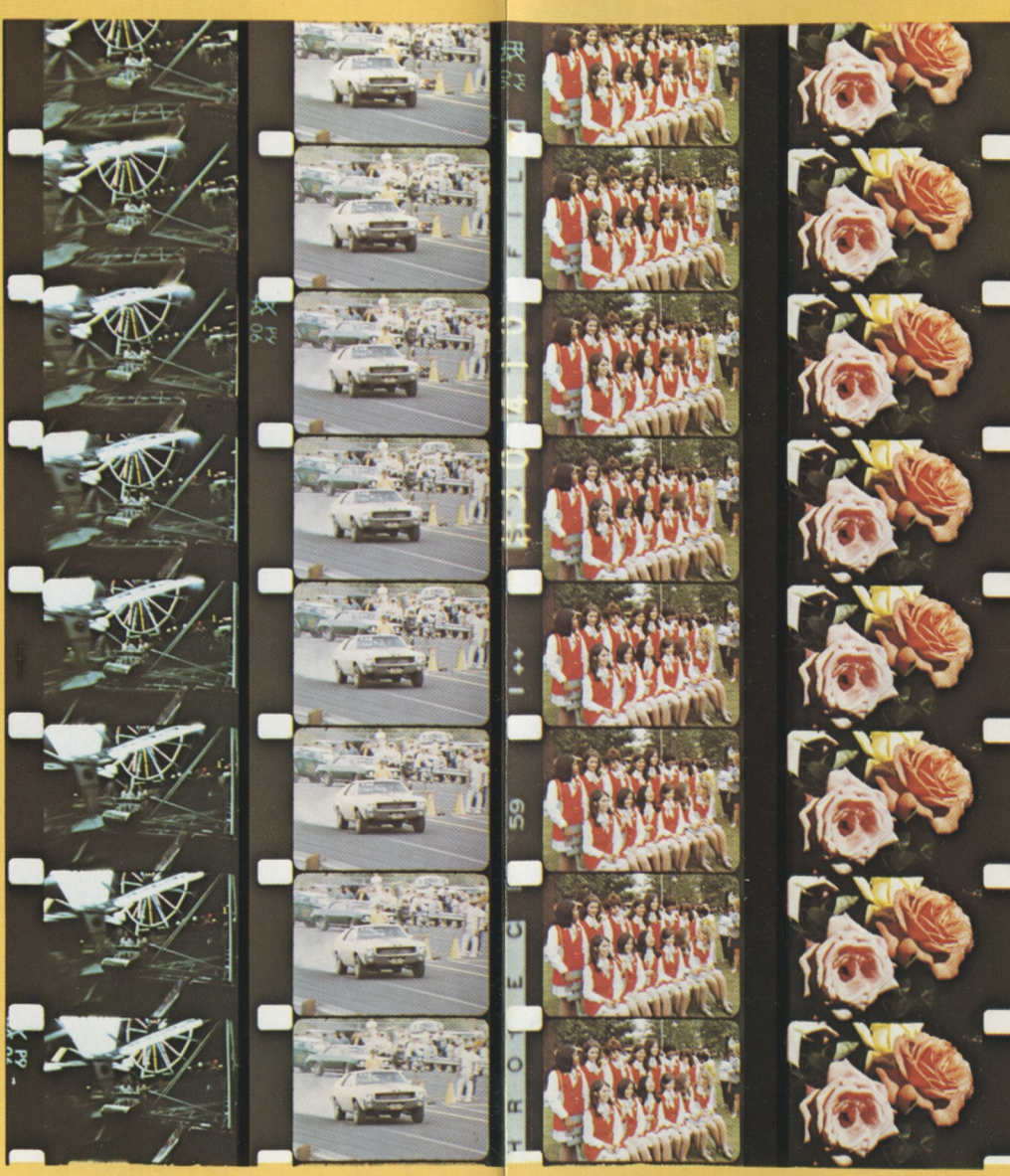
Rides, food, shows, exhibits at the family Festival Center