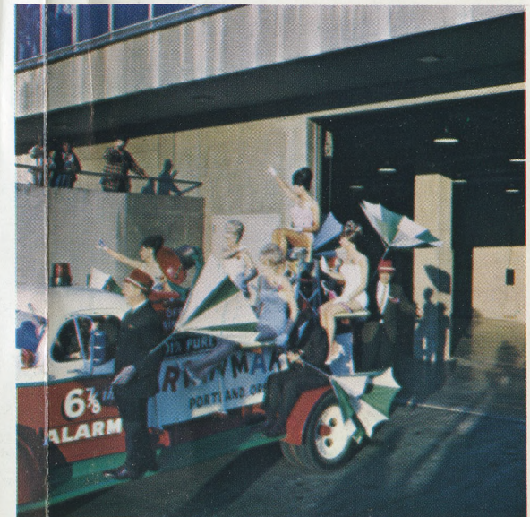
Merrykhana Parade. Laugh and more laugh the progress Merrykhana whose twin p are the amus participants huge audience DAY, JUNE 1-

Festival Cer val rides, st food booth equipment, displays ma busy Festiv which is o day and eve Festival.