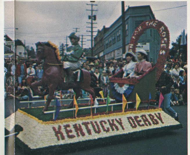
Junior Rose Festival Parade. Largest children's parade in the United States, involving some 10,000 youngsters—that's the Junior Rose Festival Parade, held annually on Portland's east side. FRIDAY, JUNE 7 — 1:30 p.m.