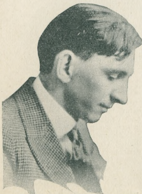
Charles Wakefield Cadman

Torn by war between the Red Rose and the White, But wedded to bloom, the English Rose of Peace; Struggling toward freedom in the Pilgrim Rose of Hope; Climbing to liberty, our own Colonial Rose, the Mary Washington; And then, the little Mission Rose, Finding at last a home in Oregon.