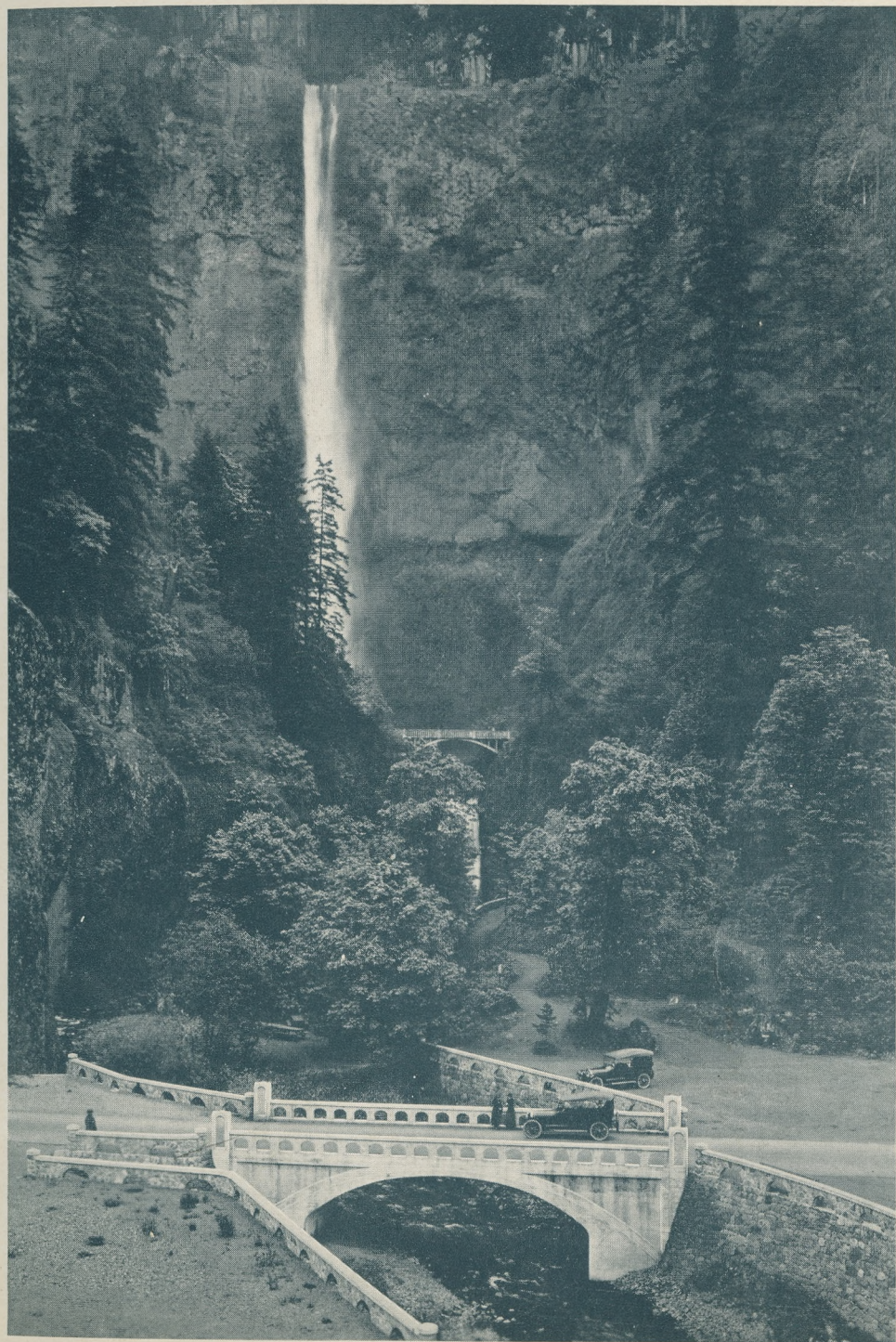
Multnomah Falls on the Columbia River Highway, Portland