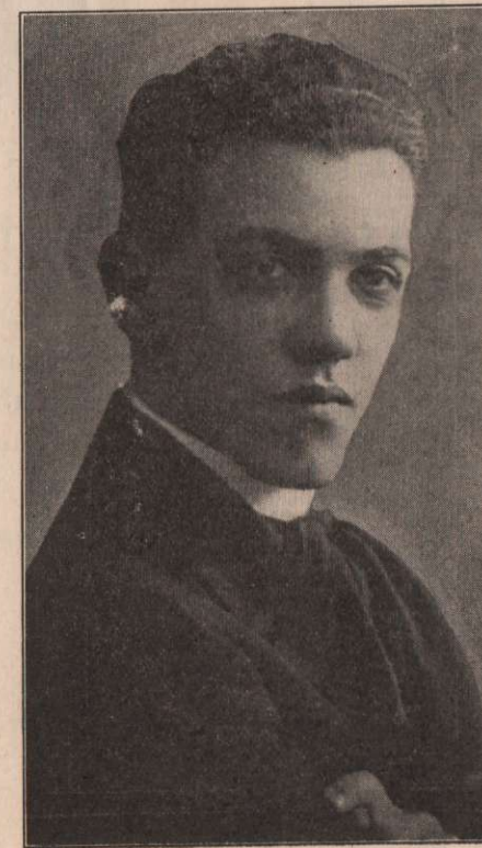
WM. LOWELL PATTON Pianist.