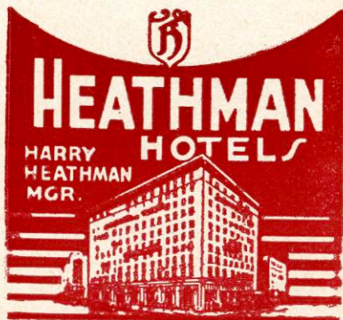
Salmon at Park

Program compiled and published by Gerald G. Acklen