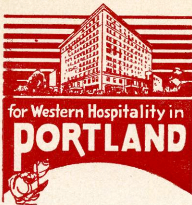
Broadway at Salmon