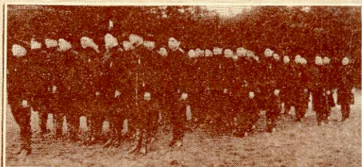
DON COSSACK CHORUS