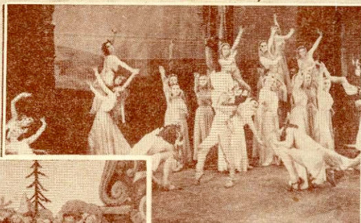
BALLET RUSSE DE MONTE CARLO

FOUR EXCEPTIONAL ATTRACTIONS AT POPULAR PRICES SAVE AS MUCH AS 50% WITH SEASON TICKETS