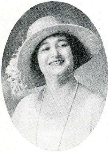
EMILIE LANCEL Contralto